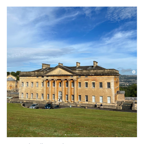
Prior Park College, Bath, UK