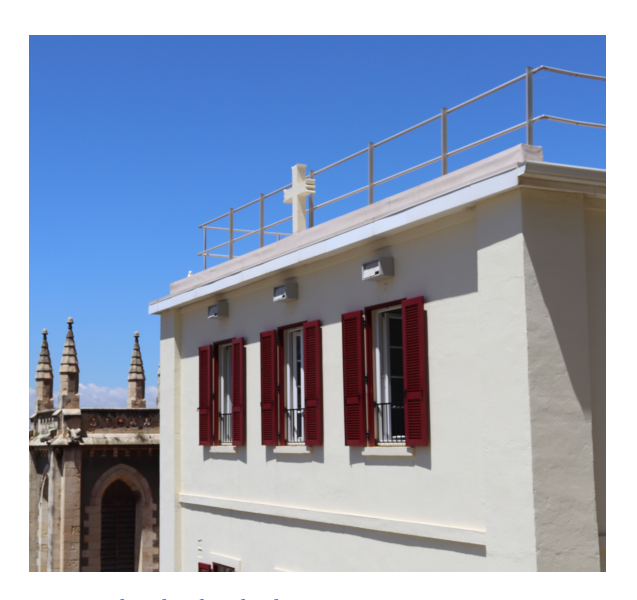
Prior Park School, Gibraltar

Prior Park School in Gibraltar is part of a family of British schools, which allows us to offer students a unique learning experience with collaboration between Gibraltar and Prior Park College based in Bath, UK. The extra support available to students from the College is an invaluable asset to students during their A Level Programme. Teachers, mentors and other A Level students can offer another perspective to our students and can enhance their overall learning experience.